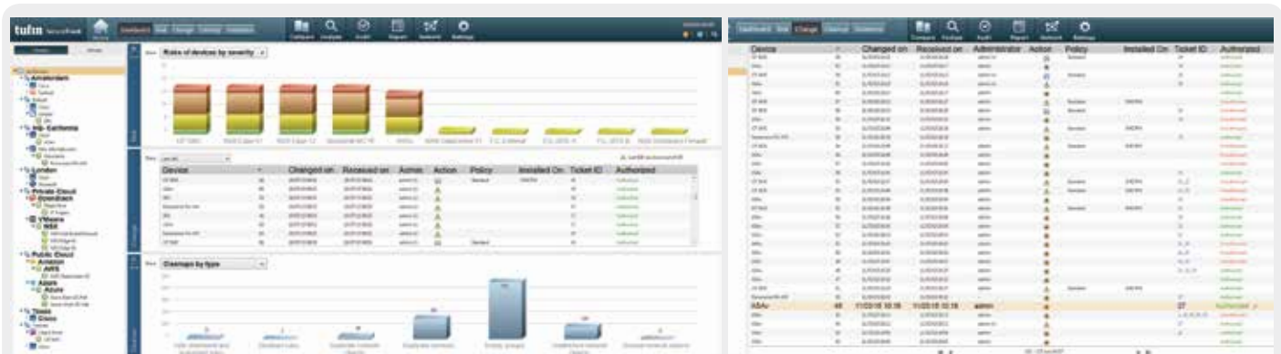
Main dashboard and detailed view

SecureTrack's real-time visibility into all firewall and security changes across the enterprise provides clear insights into network connectivity and policy changes, with alerts for potential new security risks. With this real-time visibility, trouble-shooting of issues is simple and quick. SecureTrack provides firewall administrators and security teams with the tools required to rapidly understand and manage network security.